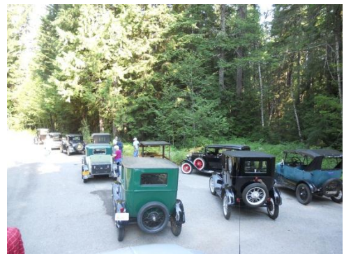
On our way to Paradise on Mt. Rainier