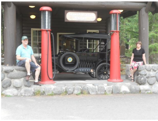
Our Hosts on the way to Sunrise