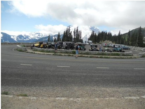
Sunrise point elev. 6100 ft.