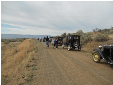
Grand Finale road less traveled

Wednesday morning we checked out of the Packwood establishments and headed back up the mountain. We had two destinations for the day. First a trip to Sunrise at 6400 feet for lunch and then on to Whistlin' Jack Lodge for our final overnight stay. The pull up the mountain was spectacular, with sheer mountain cliffs where the view from the tree tops were beyond my description capabilities. There were breath taking vistas as the road switched back right up to the very top. Henry got in the proper torque range and pulled the mountain steady as you please in low Ruckstel high pedal. It was a gorgeous drive. The weather finally had cooled to the very comfortable stage, which surely enhanced everyone's enjoyment level. We spent a couple of hours at Sunrise and then headed over Chinook Pass to Whistlin' Jack's for overnight and dinner.