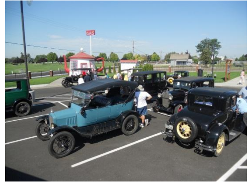
Restored Tea Pot Gas Station

Tuesday August 7 th was our first day up the mountain. Our destination was Paradise up the mountainside at 5600 feet. Gosh, when it's not raining in the Cascade Mountain range, you can almost feel God smiling down upon you. Such beauty is surely manifested by the Creator! The climb to Paradise was certainly a doable drive, but was a little tough for a T close to the top. High Ruckstel low pedal was needed, but the grand old Ford never faltered!