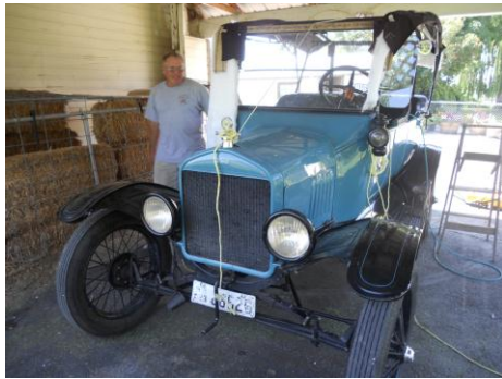
New Pads and webbed strapping