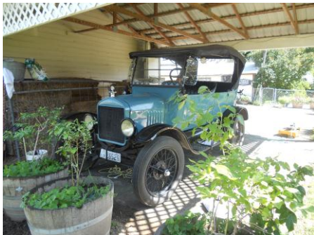
New top ready for service