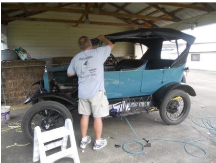
Getting the front right is HARD