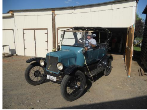
Movin to a shady spot