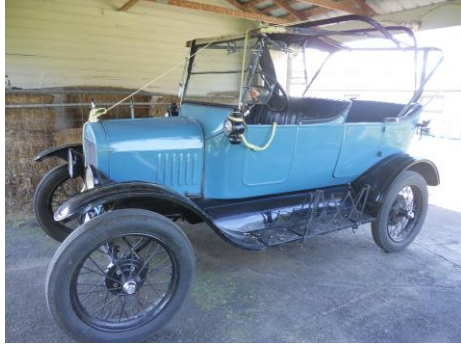
Top Bows prepped and wrapped